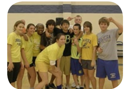
Madeira Middle School's victorious team in the all-school dodgeball tournament to raise funds for the Chain of Love