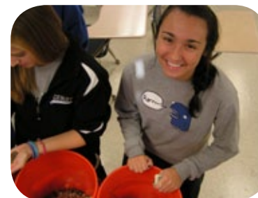
Villa Madonna Academy's Penny War funds over 800 links of the chain!