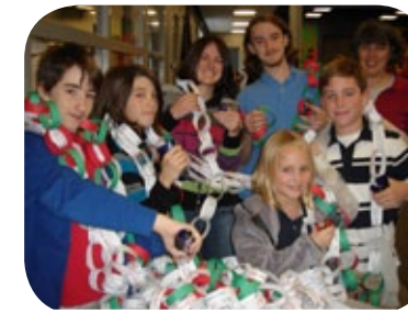
The "Chain Gang" at Cincinnati Country Day School linked together thousands of chains to prepare them for display at Sycamore Plaza